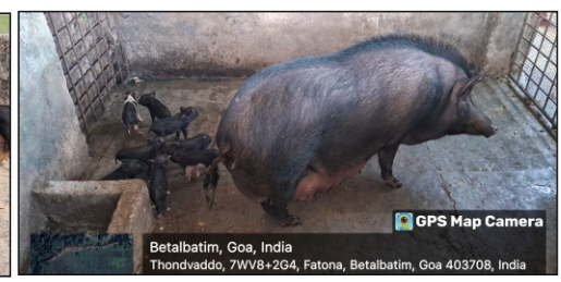
Purebred Agonda Goan stock