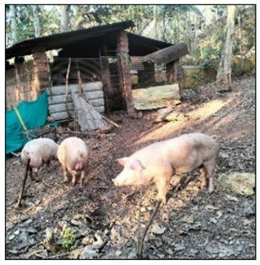
Backyard pig farming

Profitable pig farming opens the way for entrepreneurship development among unemployed youths, especially women farmers. However, farmers face many challenges during the initial stage of pig farming. Improper knowledge of scientific rearing practices, high feed cost, lack of important vaccines, and emerging diseases are major challenges for the farmers due to which many had incurred profound financial losses in the coastal region. Demand for improved crossbred piglets and unavailability of adult elite germplasms are also major problems for the farmers. During a visit to the Institute, Mrs. Pobrinha Carvalho, a scheduled tribe farm woman and resident of Diwar island, Tiswadi, got impressed with the prospects of pig farming and farm inputs that could be availed under Scheduled Tribe Component (STC) of AICRP on Pig. She got interested and started a small backyard pig farming, but faced problems like weak progeny and low productivity due to unorganized rearing, unbygienic environment like weak progeny and low productivity due to unorganized rearing, unhygienic environment, improper selection of breeding herd for mating and piglet mortality.