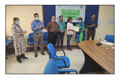
Certified trained women entrepreneur