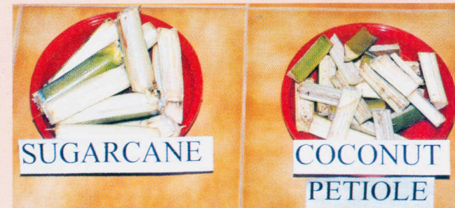
Potential food baits for use in RPW pheromone traps

The use of food baited pheromone (ferrugineol) traps can be effectively incorporated into the management strategy against RPW. Continuous trapping of adult weevils for at least one