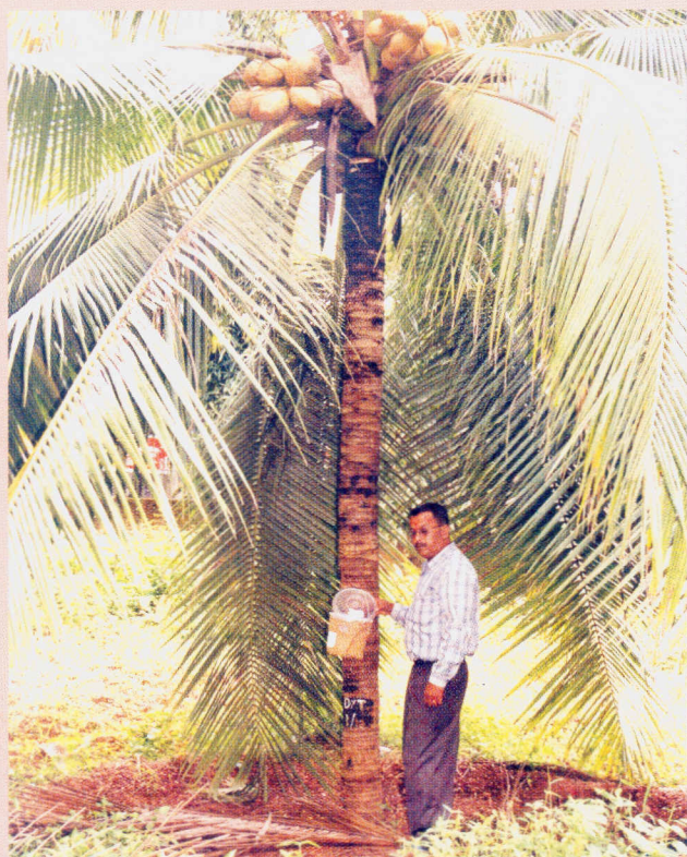
RPW pheromone traps set under shade of palm canopy ensures lure longevity

bucket lid with a piece of wire. The lid has to be secured by tying it to the body of the bucket at a single point with wire. This will ensure that the lid with the costly lure does not fly off in the field. Further, a 30 cm long plastic twine may be attached to the handle of the bucket, which is used to set (hang) the trap in the field.