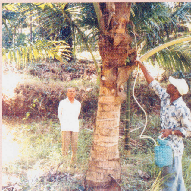
Spray young palms with insecticide (0.1% endosulfan 35 EC) before initiating mass trapping