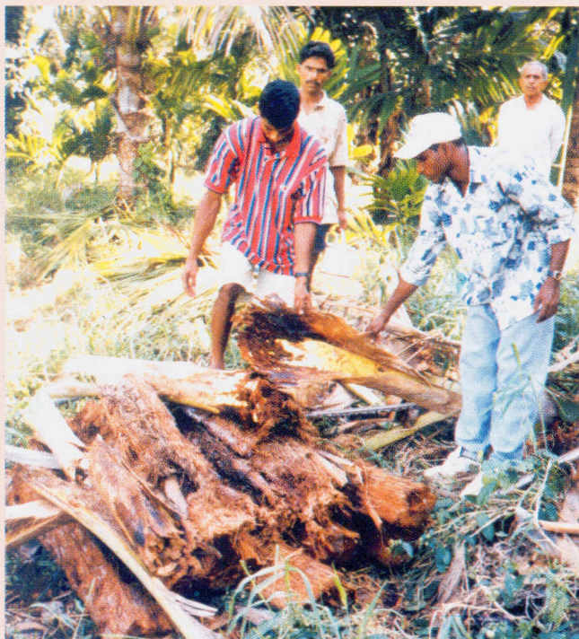
RPW infested coconut palm being eradicated