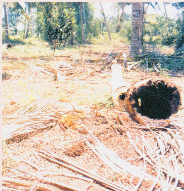
Collar region infestation by RPW resulting in toppling of the palm a decade later