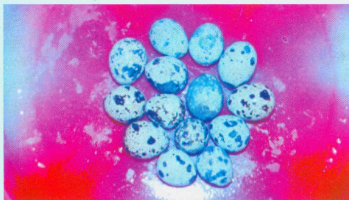
Quail eggs selected for hatching

The hatching quail eggs should be collected from the breeders between 10-30 weeks of age. Care must be taken in collecting and handling of eggs because they are thin shelled and may crack easily. For optimum fertility the parents should be 12-24 weeks of age. One male should mate to 1-3 females and eggs should be collected for hatching 4 days after the introduction of males to females. The eggs should be clean, normal in shape with sound shell and uniform size. The eggs should be disinfected by fumigation with formaldehyde gas (mixture of 40 ml of 40 per cent commercial formalin and 20 gram of potassium permanganate for each 2.8 cubic meter air space) for 10-20 minutes and should not be stored more than a week in a cooler maintained at 13°C and 75 % relative humidity (RH). The incubation period for quail eggs is about 18 days.