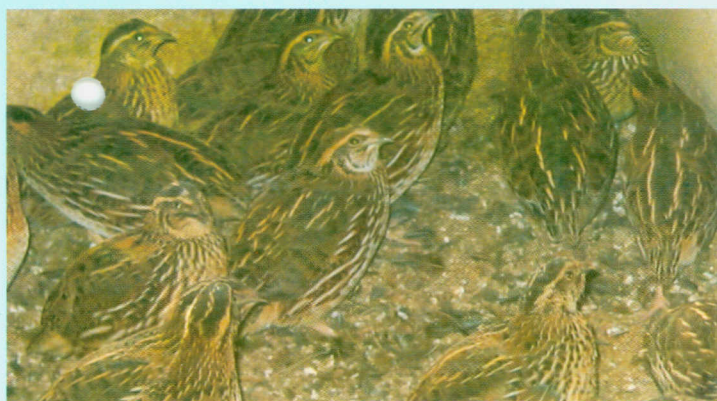
Floor rearing of quails

Quails can be reared in multideck/singledeck cages. The size of cage should be 120 cm length , 60 cm width and 25 cm height with provision of faecal trays. For commercial purpose 20-30 quails can be reared in this cage.