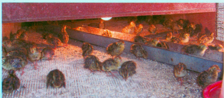
Cage brooding of quail chicks

Quails can be reared either in cages or on floors or a combination of both. Thus, the options for rearing systems are option I. Brooding (0-3 weeks), rearing (4-8 weeks) and laying (8 weeks onwards) in deep litter, option II. Brooding, rearing and laying in cages and option III. Brooding in battery brooder and both rearing and laying in deep litter. The optimal rearing environment and floor, feeder and water space requirements are shown in Table 1.