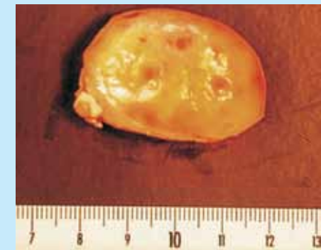
Ovary in anoestrus cow